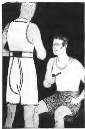
At left: Sunbonnet Union Suit with patented tag-of-war belt, only $1. Others from 75c to $2. At right: Singlet, new cut and shorts, at 10c, 75c and $1. White and colors. Wide choice of fabrics.