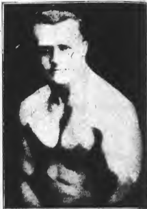
EARLE LIEDERMAN, The Muscle Builder

Sounds good, what? But listen! That isn't all. I'm not just promising these things. I guarantee that it's a sure bet. Oh, boy! Let's ride.