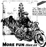
"45" Twin — One of the 1930 models. Harley-Davidson price range from $250, f.o.b. factory.