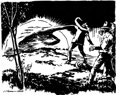
The object shot forth another testicle.