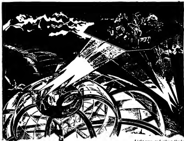
Light-rays and silent flashes seemed to envelop us.