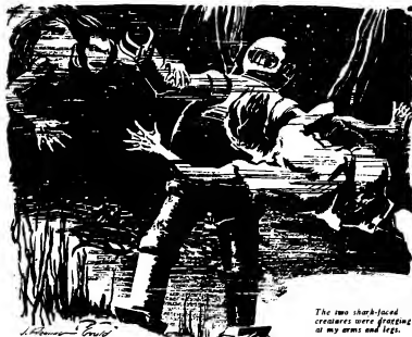
The two shark-faced creatures were frapping at my arms and legs.