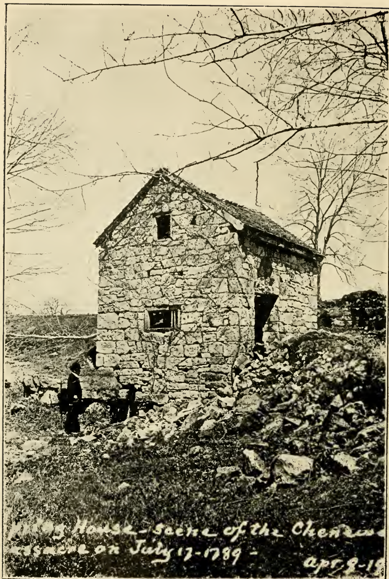
SPRING HOUSE—SCENE OF THE CHENOWETH MASSACRE ON JULY 17, 1789.